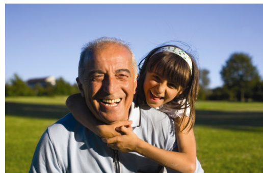
Celebrating all ages

In 1926, we were called the Girls Cottage because we had become a center for teenage girls with varying problems. Thirty years